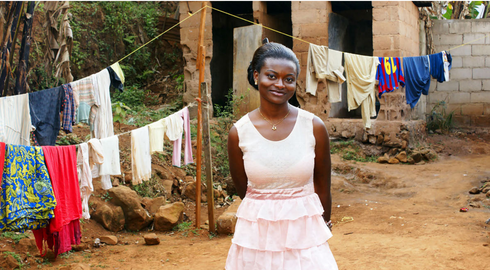
Beautiful young African woman in backyard with clothesline.

with the competence to ensure that gender-related project outputs and expected accomplishments are pursued actively.