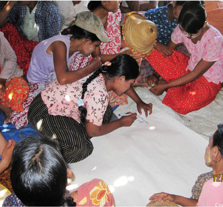
women role in community development, Myanmar.