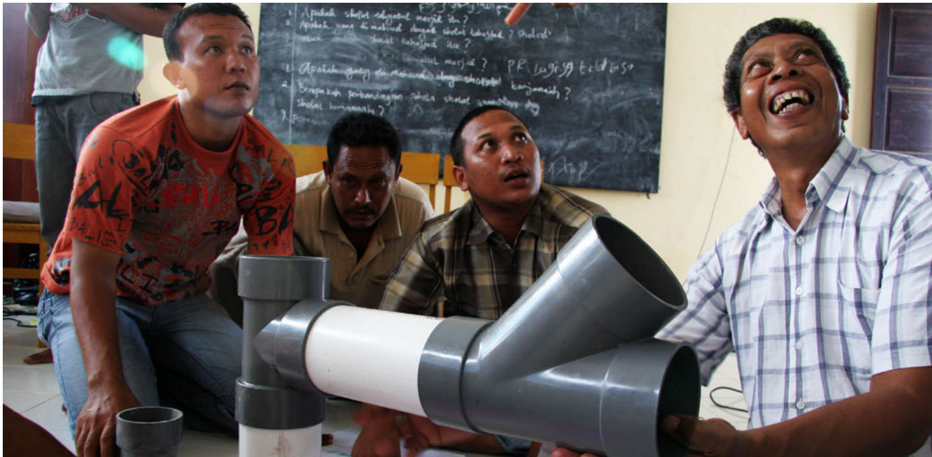
ASAAP, Indonesia.

Governing Council Resolution 23/11 of April 2011, requested the Executive Director to ensure that the Strategic Plan 2014-2019 has the achievement of gender equality and empowerment of women as one of its objectives, with gender results defined at the higher and lower levels of the expected accomplishments and gender outputs per focus area clearly integrated into the work programme.