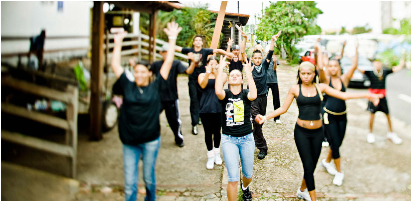
Youth participation, Uberlandia, Brazil.

men's concerns and experiences an integral dimension of the design, implementation, monitoring and evaluation of policies and programmes in all political, economic and societal spheres so that women and men benefit equally and inequality is not perpetuated. The ultimate goal is to achieve gender equality 9 .