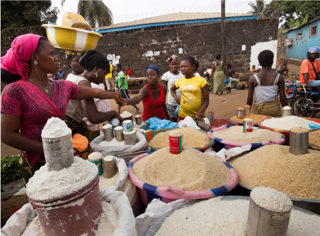
Women sell various grains from a roadside stall in Monrovia, Liberia on February 19, 2012.

it is a challenge to work within male-dominated party systems, and to navigate political spaces in which priorities do not reflect those of the constituencies that elected them.