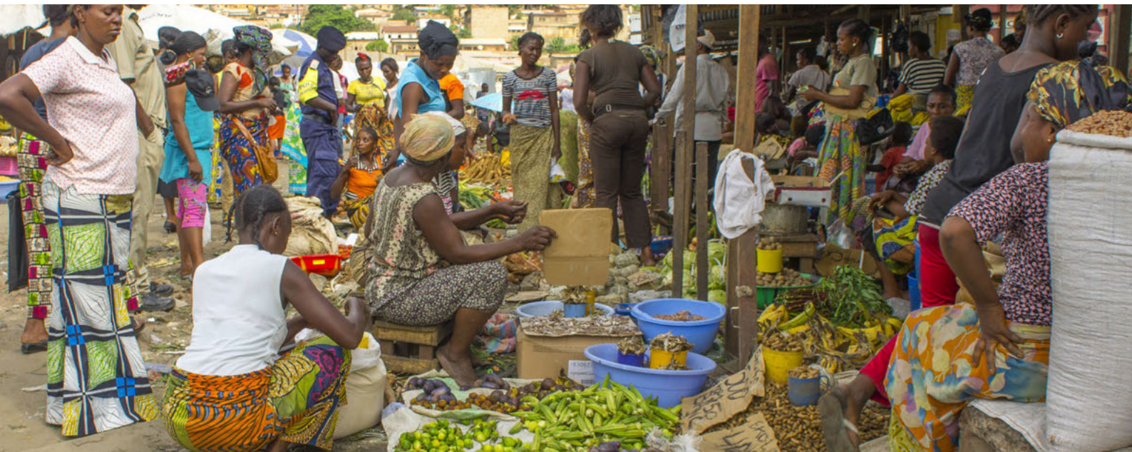
Open food market in Matadi, Democratic Republic of the Congo. Circa January 2014.

Where there is risk of shortfall in any of the commitments made in this document, the Office of Internal Oversight Services will be invited promptly to undertake an audit, so that remedial action can be taken in a timely manner.