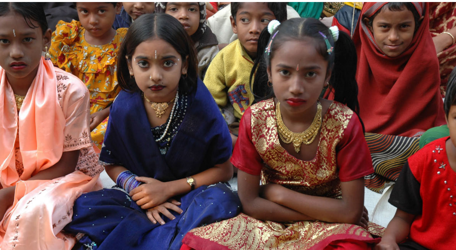
Young girls follow proceedings at a function in Bangladesh.

The detailed Regional Gender Plan for the Latin America and Caribbean Region expands and details this broad outline