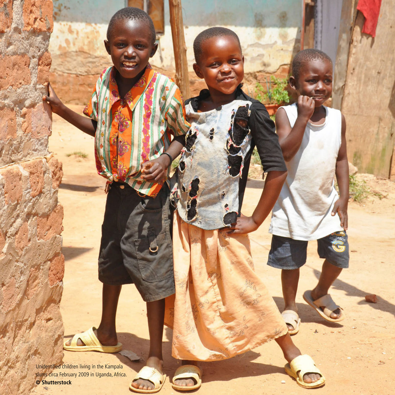
Unidentified children living in the Kampala slums circa February 2009 in Uganda, Africa.