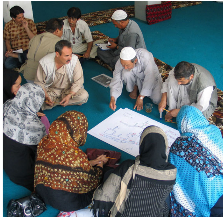
CAP Workshop in Afghanistan.